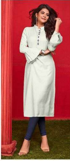
..... 51 .....