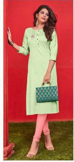
..... 54 .....