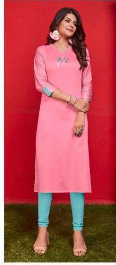
..... 53 .....