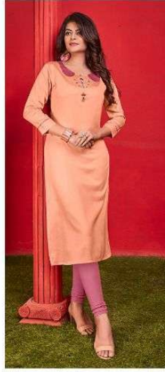
..... 52 .....