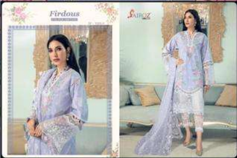
Bottom & Patch