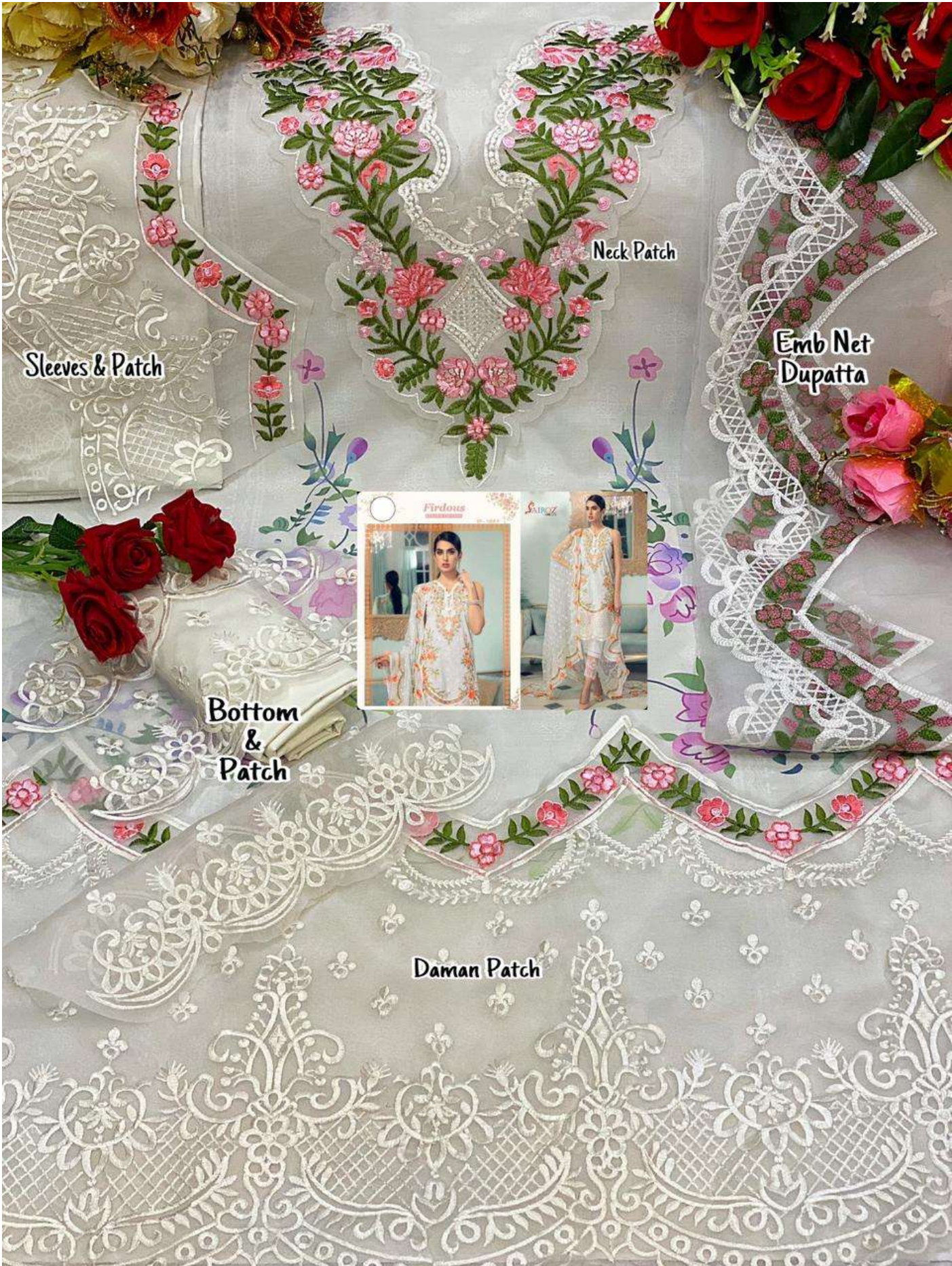
Sleeves & Patch