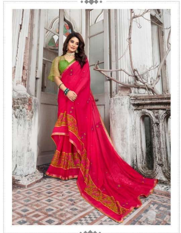
71006 Everyone begins a saree slightly differently and everyone's body looks different in it.