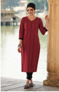
• 39033 •