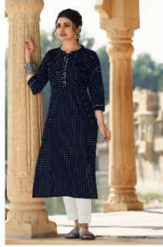
• 39034 •