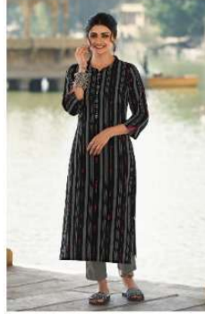
• 39037 •