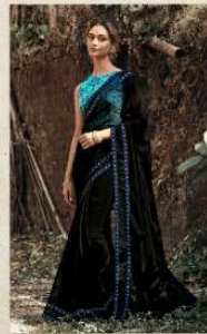
D. no. 11C 11