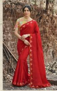
D. no. 11C 09