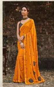
D. no. 11C 12