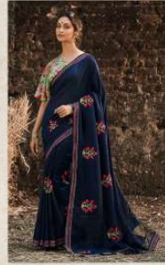
D. no. 11C 08