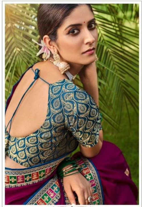
WINE BAHU SILK EMBROIDERED SAREE, HAVING EMBROIDERED LACES AND TUSSELS, PAIRED WITH PEACOCK BLUE BROCADE BLOUSE.