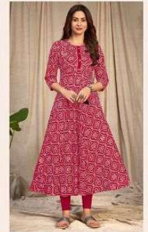
STYLE / 1006