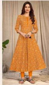
STYLE / 1004