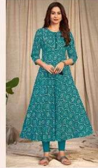
STYLE / 1002