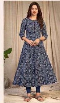
STYLE / 1005