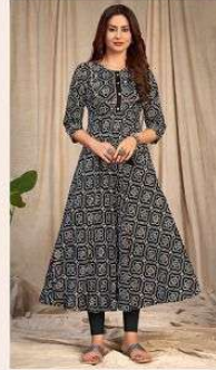
STYLE / 1001