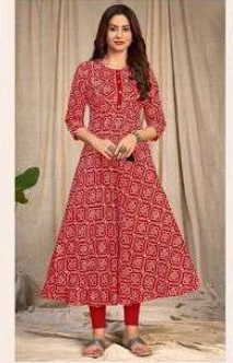
STYLE / 1003