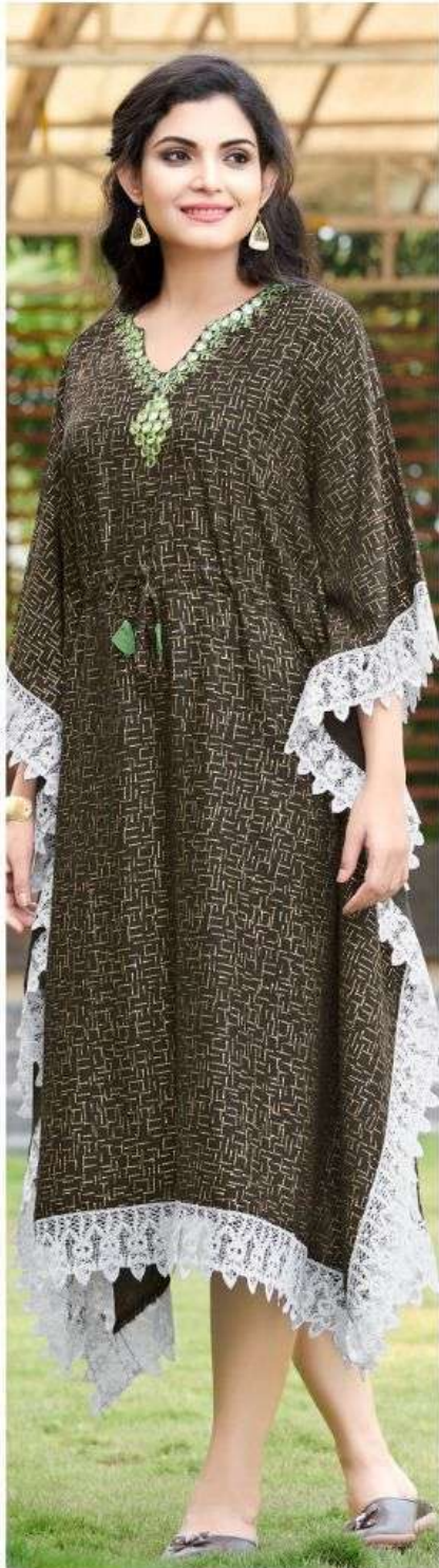
Style - 205