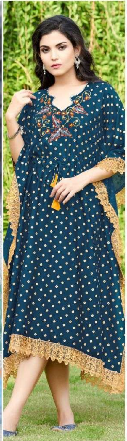
Style - 207