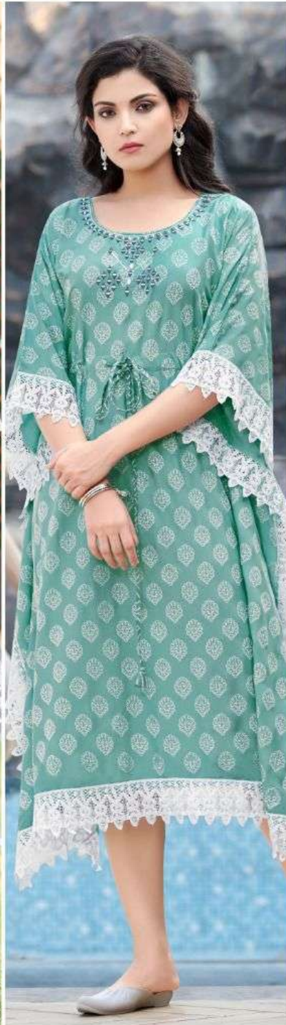
Style - 206