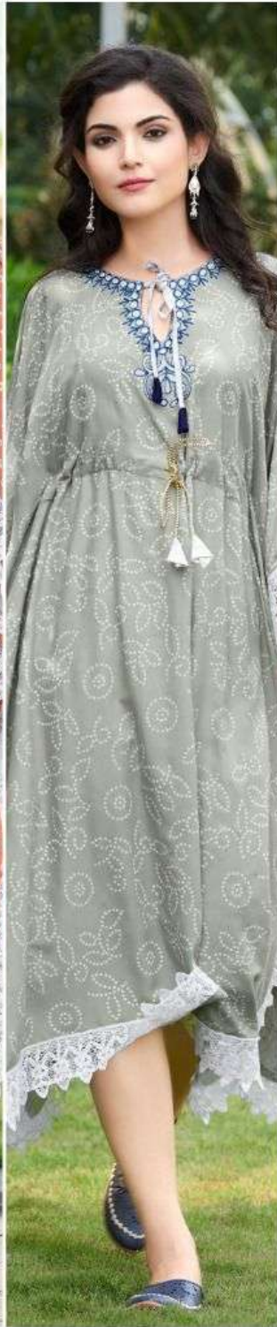
Style - 202