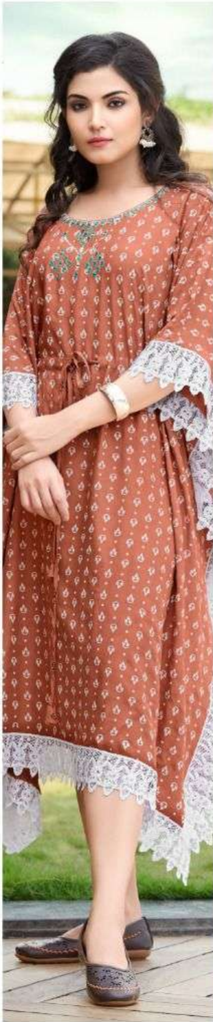
Style - 201