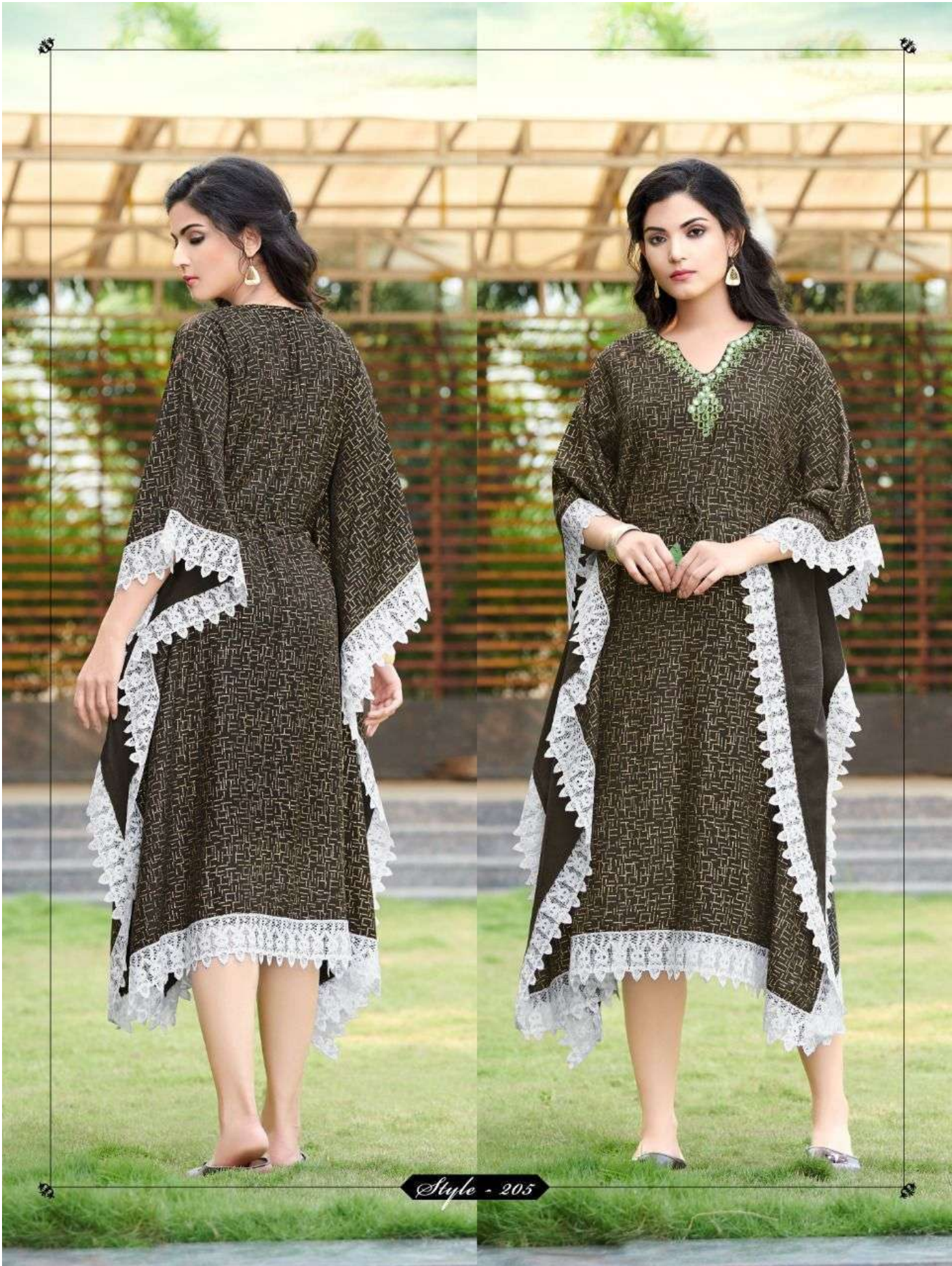
Style - 205