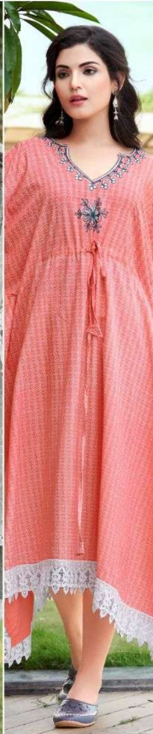
Style - 203