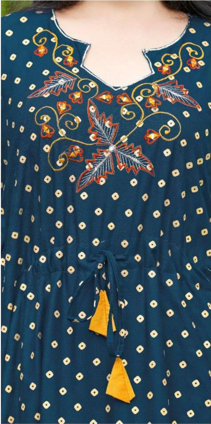
Style - 207