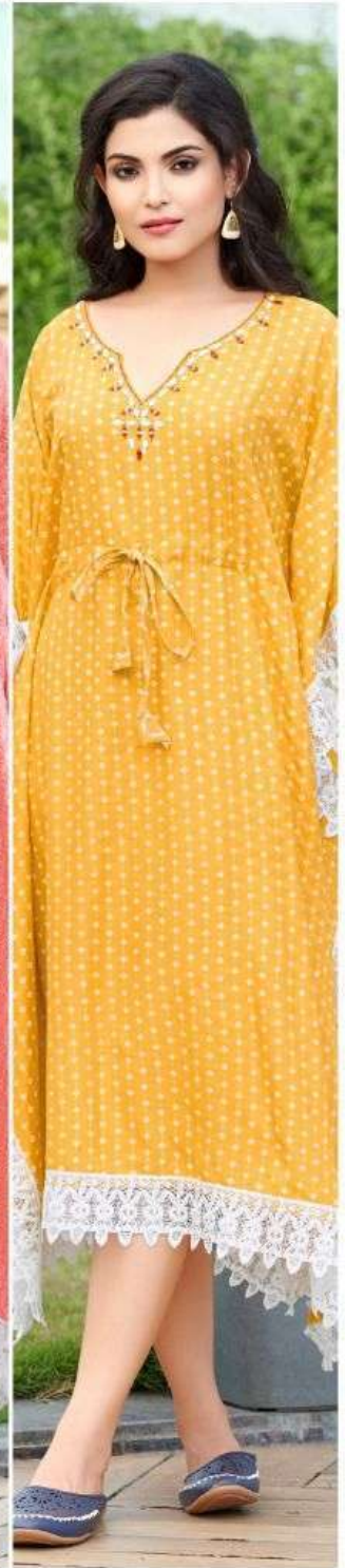
Style - 204