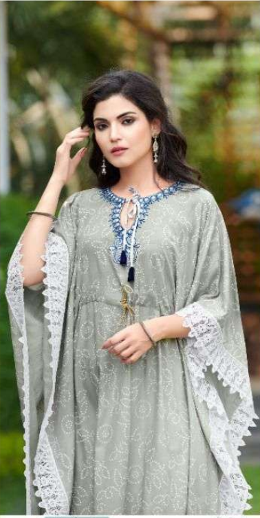
Style - 202

100% COTTON, 100% POLYESTER, 100% COTTON, 100% POLYESTER, 100% COTTON, 100% POLYESTER