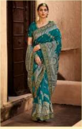
D.NO :- 2101