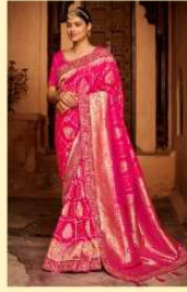
D.NO :- 2103