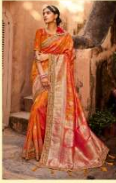
D.NO :- 2102