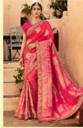
D.NO :- 2106