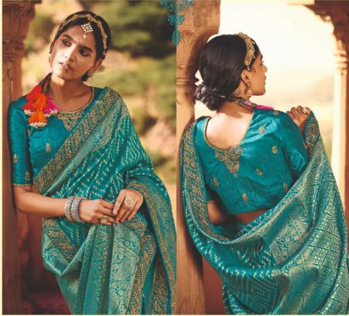
D.NO : - 2107