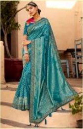
D.NO :- 2107