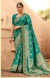
D.NO :- 2105