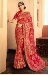
D.NO :- 2104