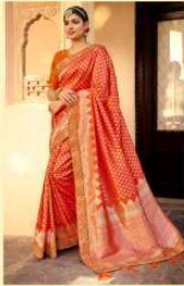
D.NO :- 2108