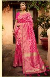
D.NO :- 2109