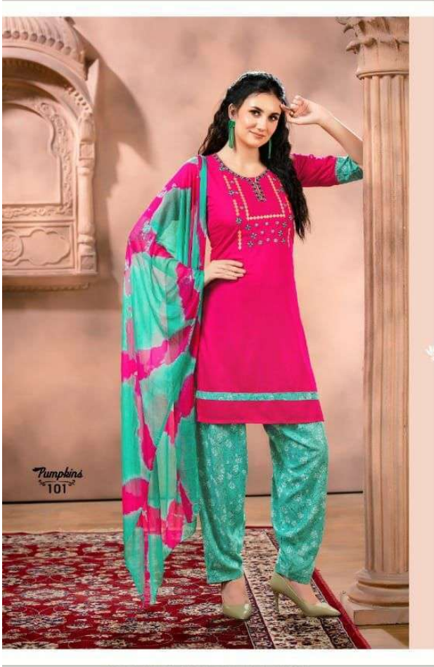
ROSE NET PARALLEL AND TRIBLE EDGETHA WITH ZARI WORK ON IT HAVING BESS NET CUTWORK KUPATTA FABRIC WITH ROSE MOTIF SATIN EMBROIDERY IN BLUE