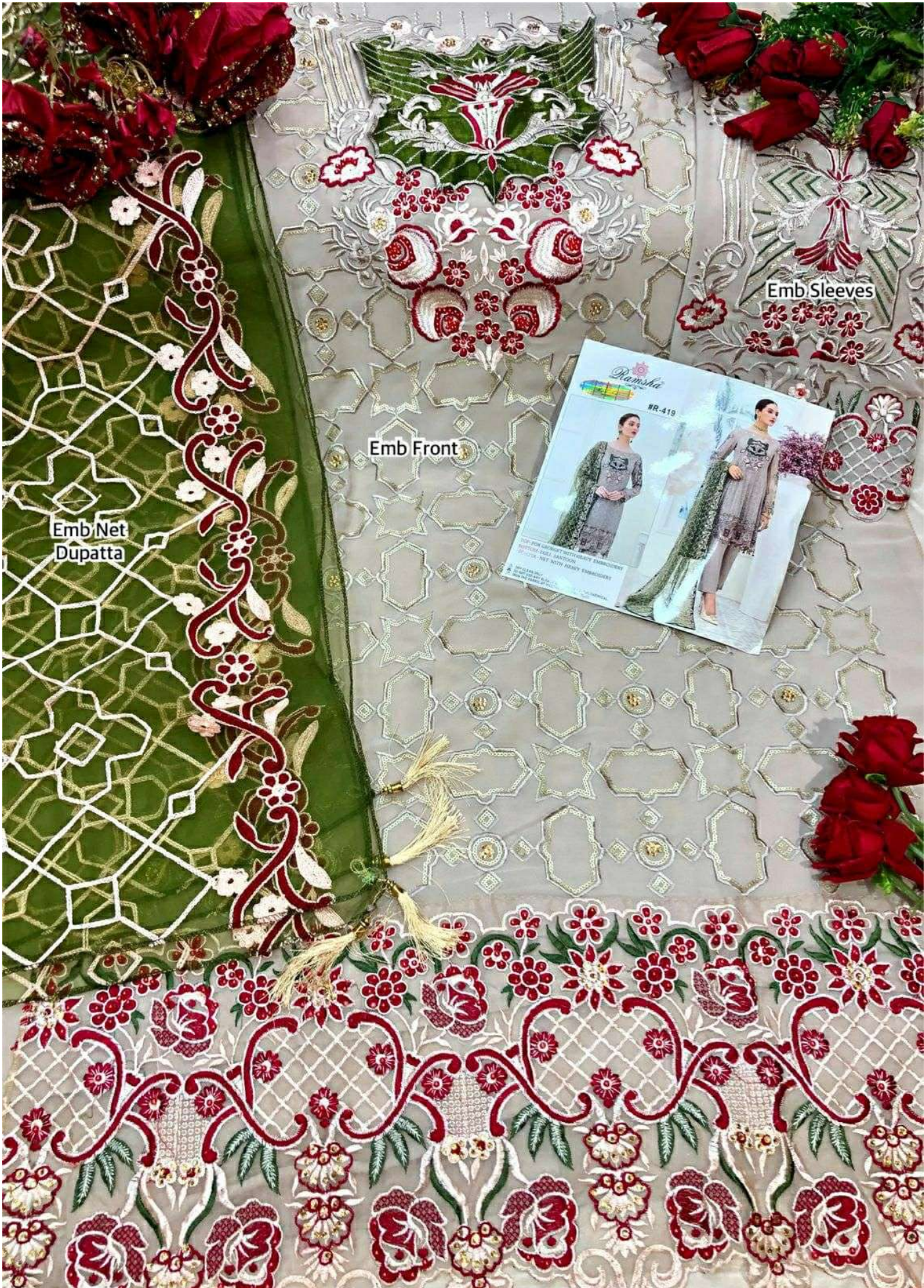
Emb Net Dupatta