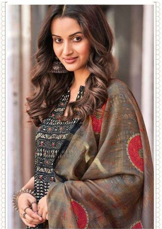
Loose fabrics, bold patterns & simplistic detailing adorn modern silhouettes.