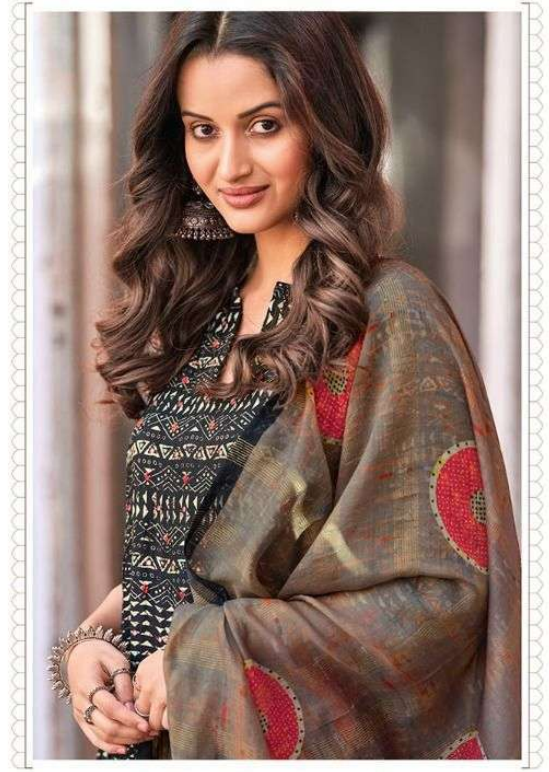
Loose fabrics, bold patterns & simplistic detailing adorn modern silhouettes.