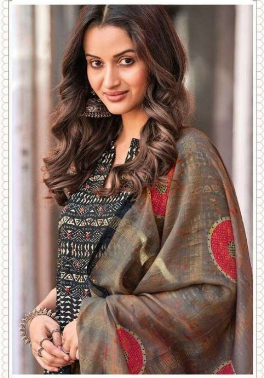
Loose fabrics, bold patterns & simplistic detailing adorn modern silhouettes.