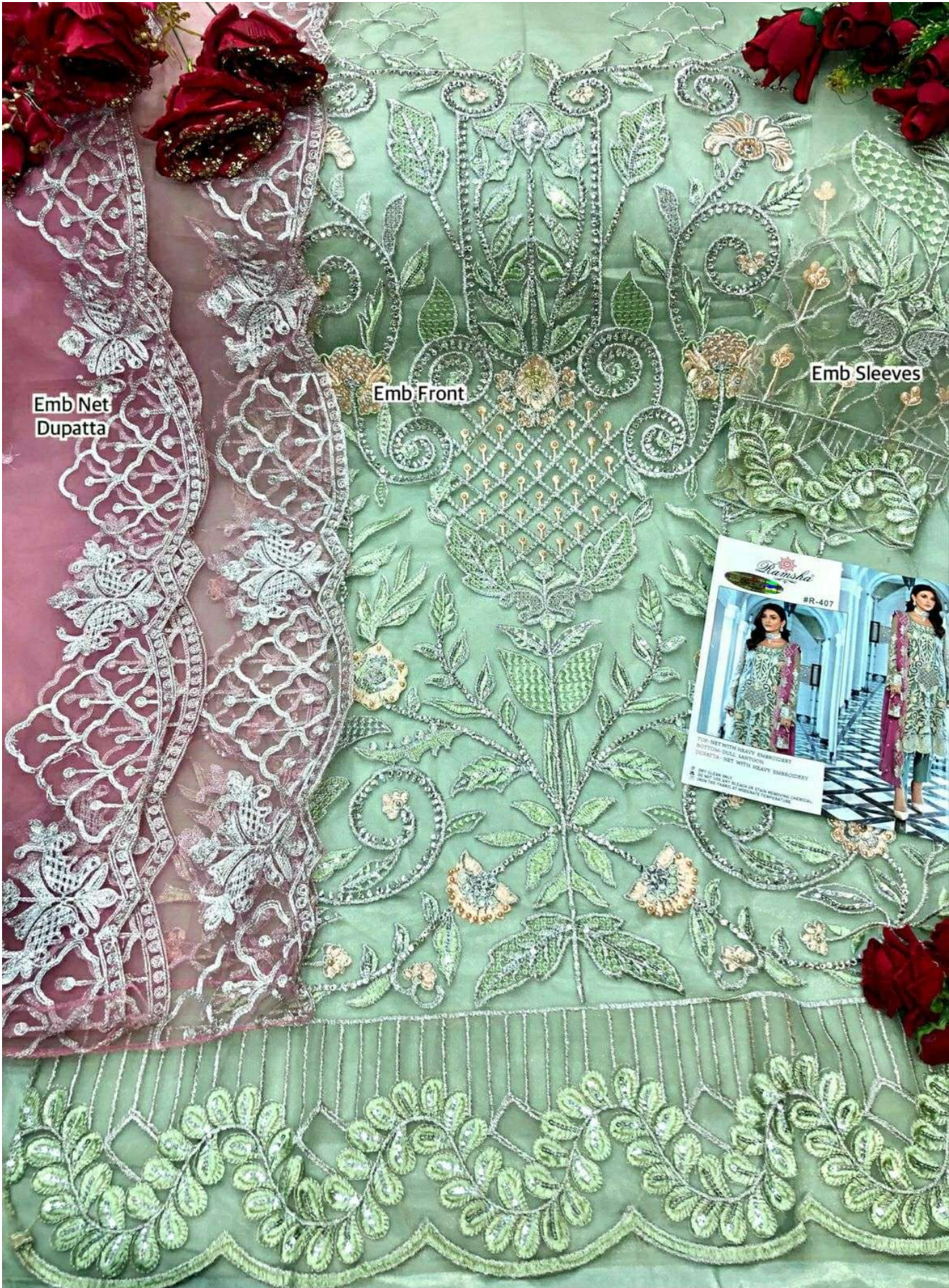
Emb Net Dupatta