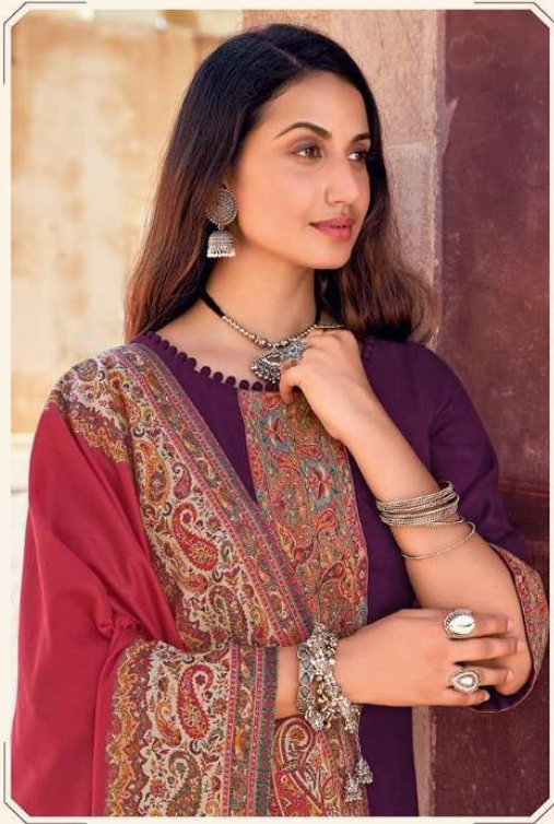
Sea Breeze | 6447