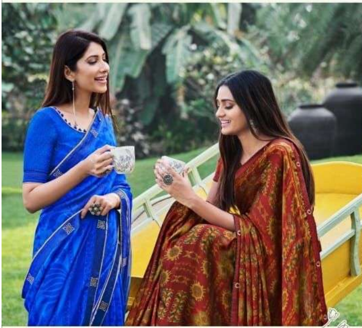
THE LOOK BRIGHTEN It's the subtle details in an outfit that make it stand out. 49507 Juhi