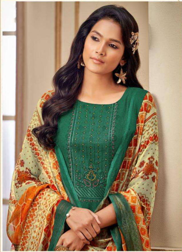
A breath taking away of fine detailing & intricate design inspired by indian culture.