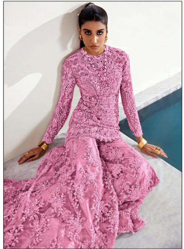
TOP - BUTTERFLY NET HEAVY EMBROIDERED UNSTITCH T/B INNER - HEAVY SANTOON BOTTOM - BUTTERFLY NET HEAVY EMBROIDERED DUPATTA - BUTTERFLY NET HEAVY EMBROIDERED