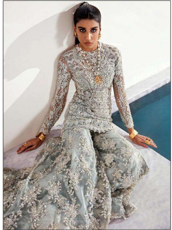
TOP - BUTTERFLY NET HEAVY EMBROIDERED UNSTITCH T/B INNER - HEAVY SANTOON BOTTOM - BUTTERFLY NET HEAVY EMBROIDERED DUPATTA - BUTTERFLY NET HEAVY EMBROIDERED