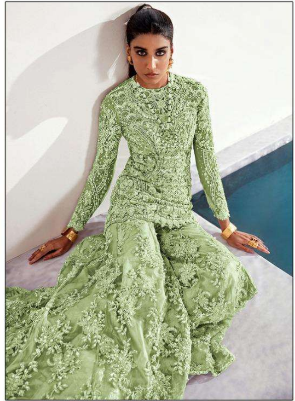
TOP - BUTTERFLY NET HEAVY EMBROIDERED UNSTITCH T/B INNER - HEAVY SANTOON BOTTOM - BUTTERFLY NET HEAVY EMBROIDERED DUPATTA - BUTTERFLY NET HEAVY EMBROIDERED