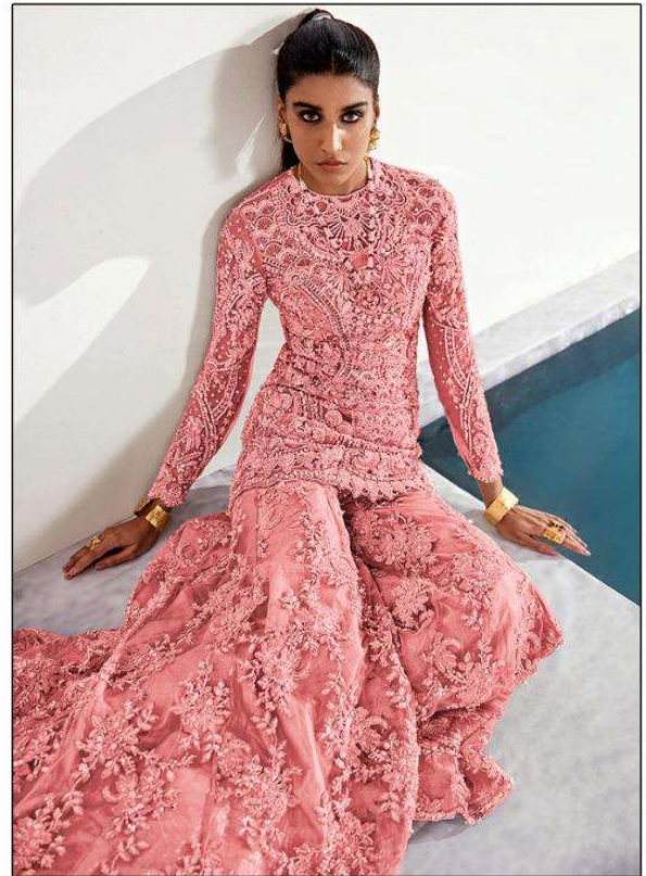
TOP - BUTTERFLY NET HEAVY EMBROIDERED UNSTITCH T/B INNER - HEAVY SANTOON BOTTOM - BUTTERFLY NET HEAVY EMBROIDERED DUPATTA - BUTTERFLY NET HEAVY EMBROIDERED