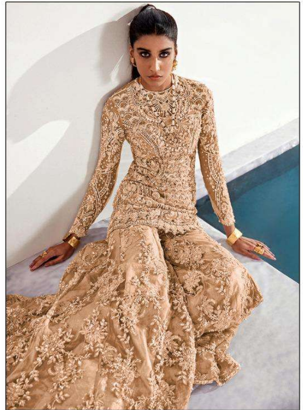
TOP - BUTTERFLY NET HEAVY EMBROIDERED UNSTITCH T/B INNER - HEAVY SANTOON BOTTOM - BUTTERFLY NET HEAVY EMBROIDERED DUPATTA - BUTTERFLY NET HEAVY EMBROIDERED