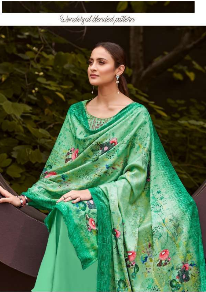
showcasing excellent work and craftsmanship, each one of these piece will make for a class apart style in your wardrobe.