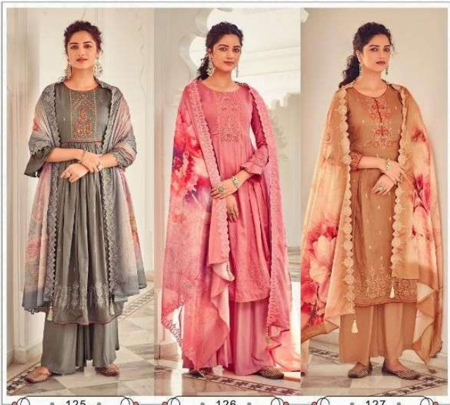
• 125 • • 126 • • 127 •