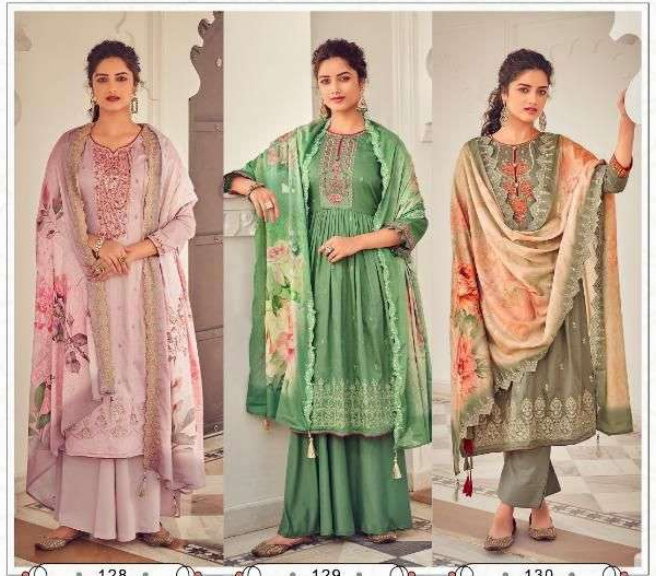
• 128 • • 129 • • 130 •