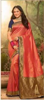
◆ 1502 ◆