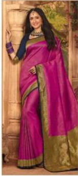
◆ 1503 ◆