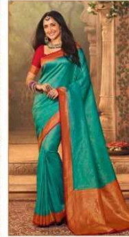
◆ 1510 ◆