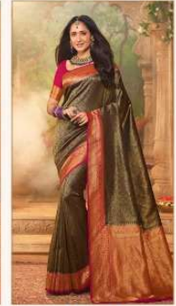
◆ 1511 ◆