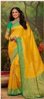
◆ 1506 ◆