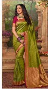
◆ 1509 ◆