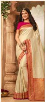
◆ 1505 ◆