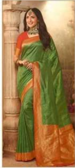
◆ 1504 ◆