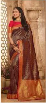
◆ 1501 ◆