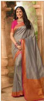
◆ 1507 ◆