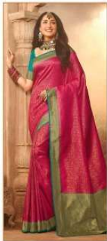
◆ 1508 ◆