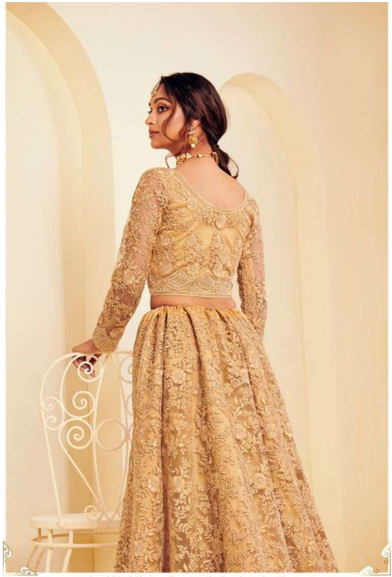
Lace fabric, bold pattern & sumptuous detailing offers modern silhouettes