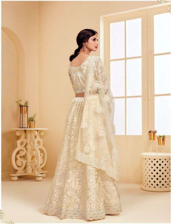
The key is to contrast two elements so you don't end up seeing the feminine quotient