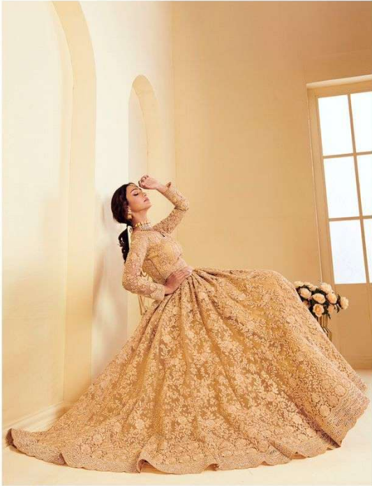
The contemporary design for the fashion conscious woman while preserving the traditional art and culture of India