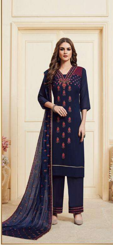
The flavor of subtle ethnic wear that meets the contemporary glam vividly explodes with minute details of elegance.