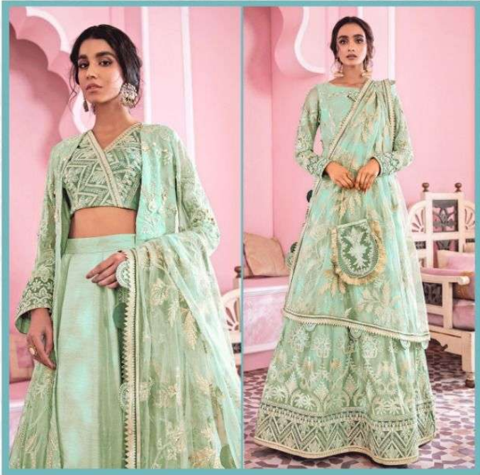
Top - Butterfly net embroidered Inner Bottom - Dull Santoon Dupatta - Butterfly net embroidered