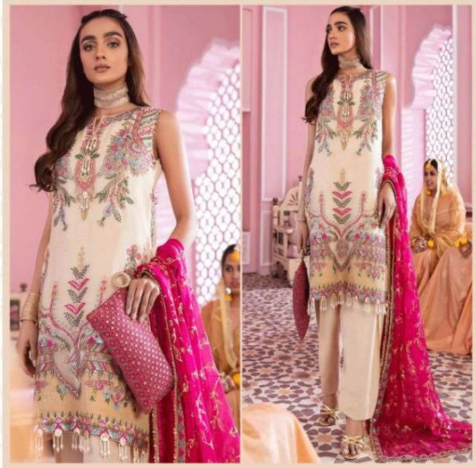
Top - Fox Georgette embroidered Inner Bottom - Dull Santoon Dupatta - Nazneen embroidered