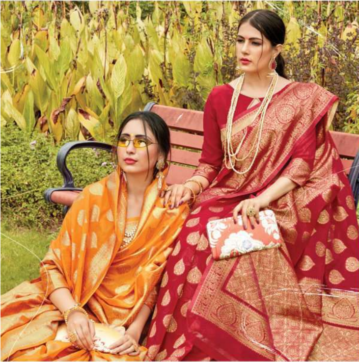
What is the common factor between design and trends? It's a fashion connection. Both are essential to give perfect fashion look to you.