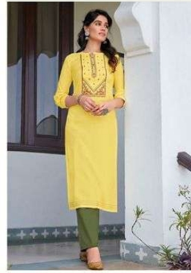
STYLE / 3227