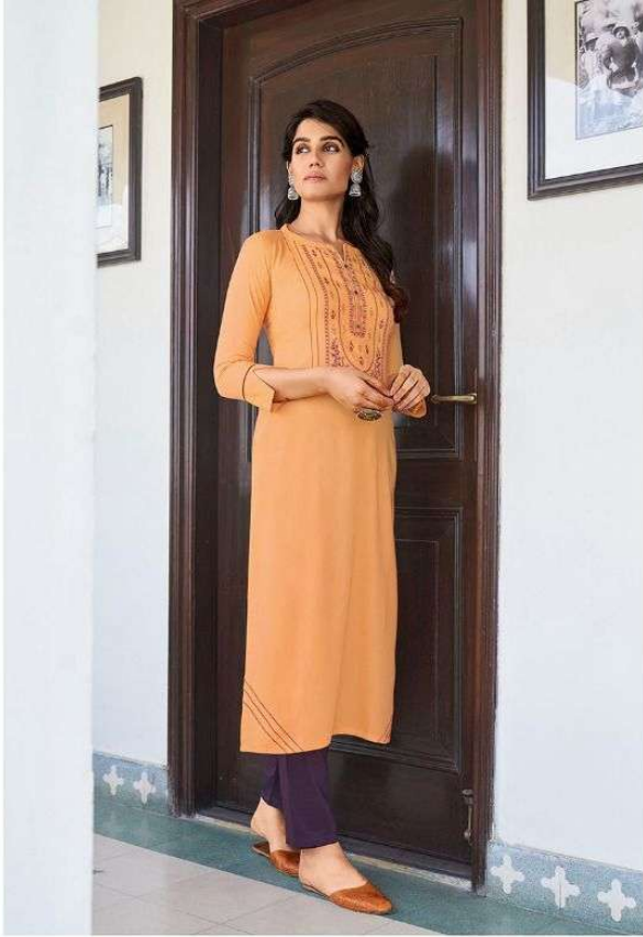
STYLE / 3224 ——— Dictate your style statement with the season's latest trends.