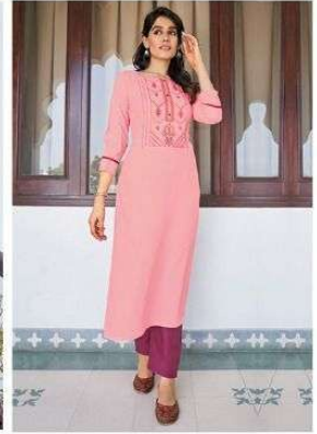
STYLE / 3228