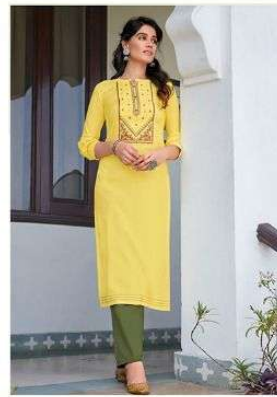
STYLE / 3227