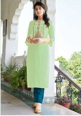
STYLE / 3221