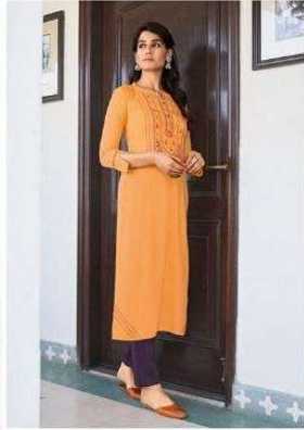
STYLE / 3224