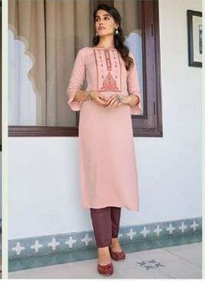
STYLE / 3226