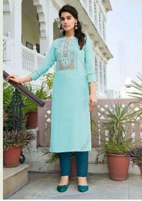
STYLE / 3222