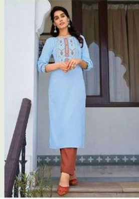
STYLE / 3225