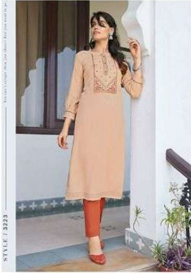
STYLE / 3223