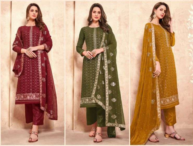
✧ 2022-A ✧