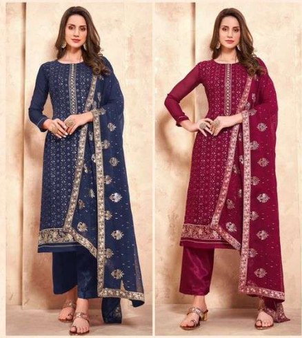
✧ 2022-D ✧