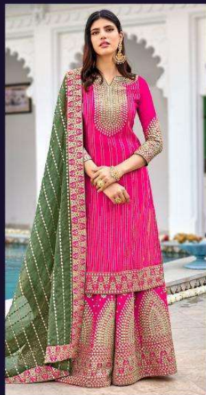
▶ 1315-B ◀