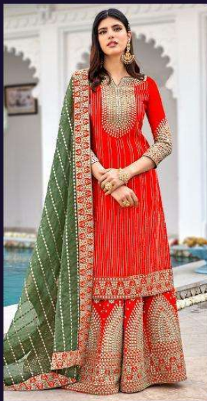
▶ 1315-A ◀