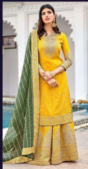
▶ 1315-C ◀