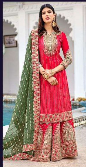
▶ 1315-D ◀