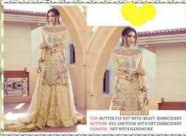
TOP: BUTTER FLY NET WITH HEAVY EMBROIDERY BOTTOM: GUL SANTOORI WITH NET EMBROIDERY DUPATTA: NET WITH HANDWORK