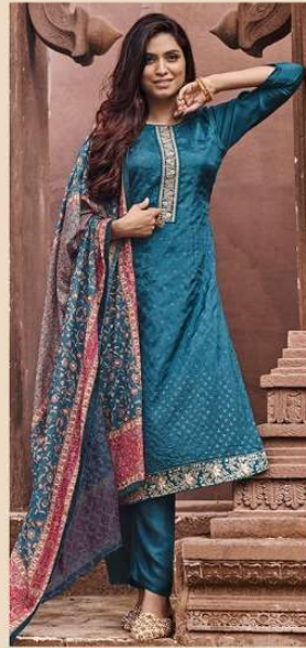
D.No : 3193