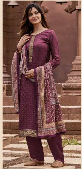
D.No : 3194