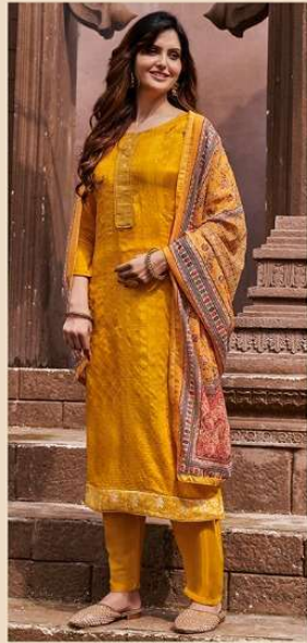
D.No : 3192