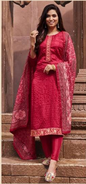
D.No : 3191