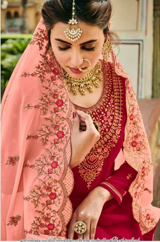
gold embroidery and floral ornamentation of the look combined beautifully with the look.