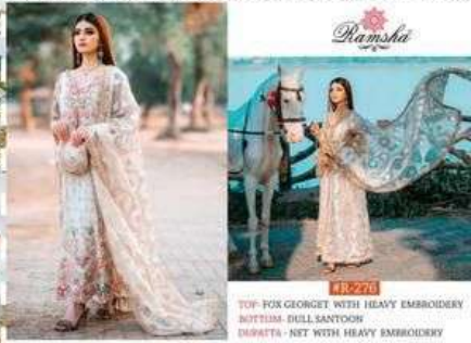
TOP- FOX GEORGET WITH HEAVY EMBROIDERY BOTTOM- DILLI SANTON DUPATTA- NET WITH HEAVY EMBROIDERY