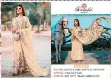
FOR GEORGET WITH HEAVY EMBROIDERY BOTTOM: SKIRT ANTIPOOR SHIRT: NET WITH HEAVY EMBROIDERY