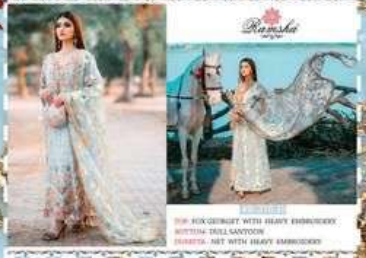
THE KICK DRESS WITH HEAVY EMBROIDERY WITHIN THE SARTON DESIGN. NET WITH HEAVY BARRICADE