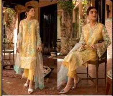
Net Pearl Dupatta