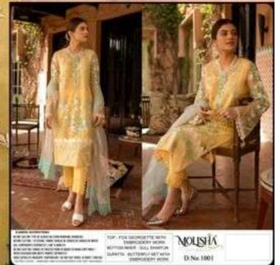
Net Pearl Dupatta