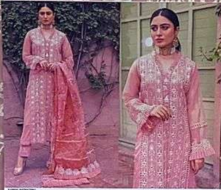
Heavy Emb Front

TOP - FOX GEORGETTE WITH EMBROIDERY & MIRROR WORK BOTTOM PANEL - FULL EMBROIDERED DUPATTA - ORGANZA SILK / COTTON PINKY D No. 1002