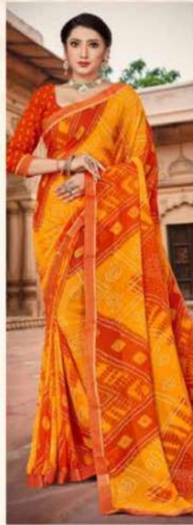
- 1003 -