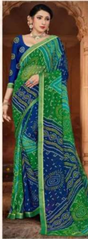
- 1002 -