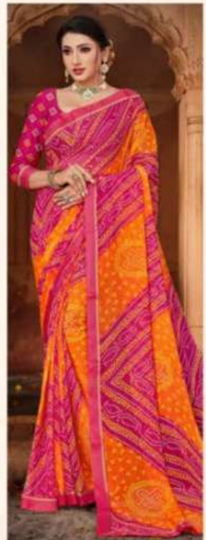
- 1008 -