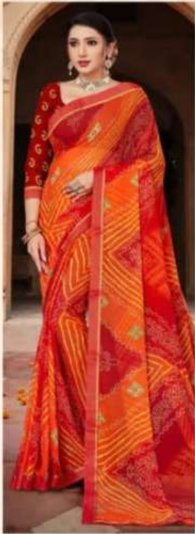
- 1001 -