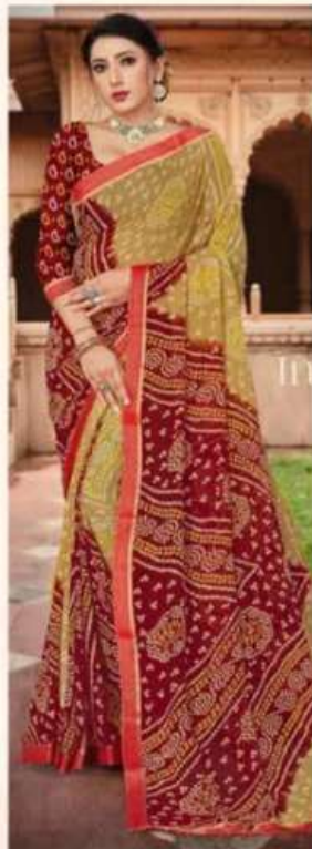
- 1006 -