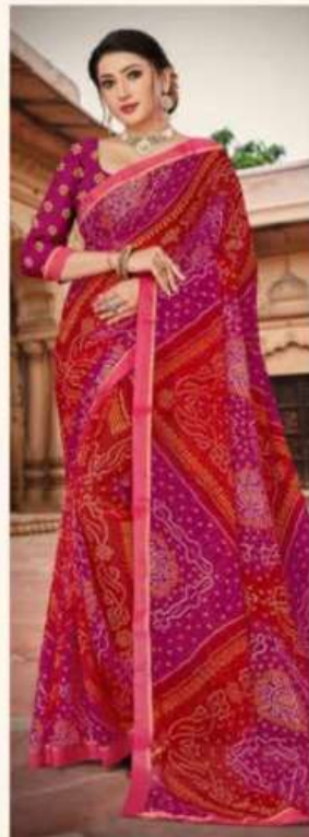
- 1007 -