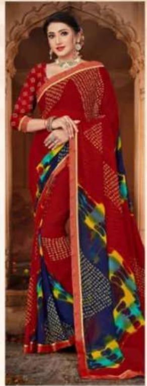
- 1004 -