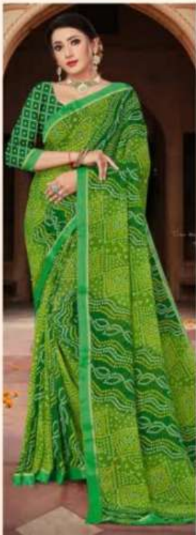
- 1005 -