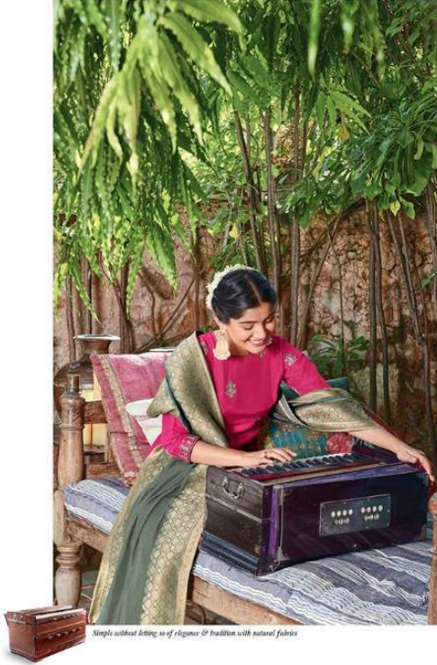
Simple without losing as of elegance & tradition with natural fabrics.