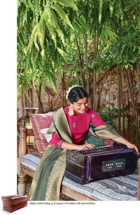
Simple without letting go of elegance & tradition with natural fabrics.