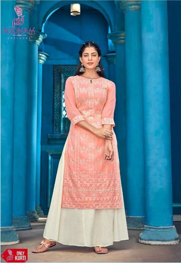
NO. _____ 201 Merge your STYLE with ELEGANCE