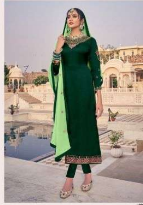
D No. 18202