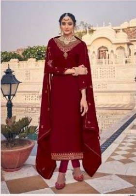
D No. 18201