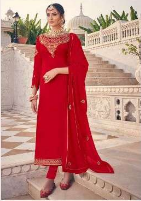
D No. 18203