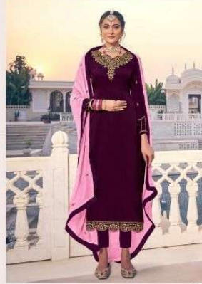
D No. 18204