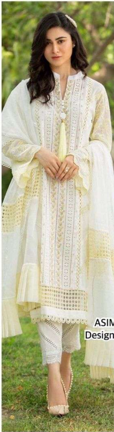
ASIM JOFA Design - 56036