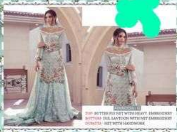
200 BUTTER FLY NET WITH HEAVY EMBROIDERY BOTTOM. SIL. SARTON WITH NET EMBROIDERY DUPATTA - NET WITH HANDWORK