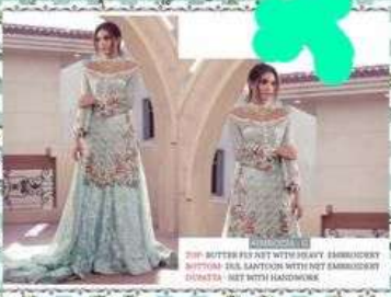
200 BUTTER FLY NET WITH HEAVY EMBROIDERY BOTTOM. SIL. SARTON WITH NET EMBROIDERY DUPATTA - NET WITH HANDWORK