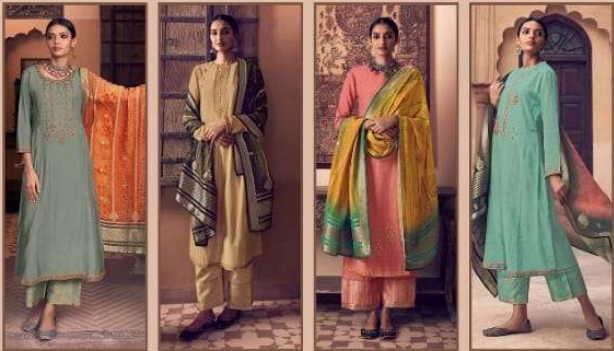
KT-44 KT-45 KT-46 KT-47