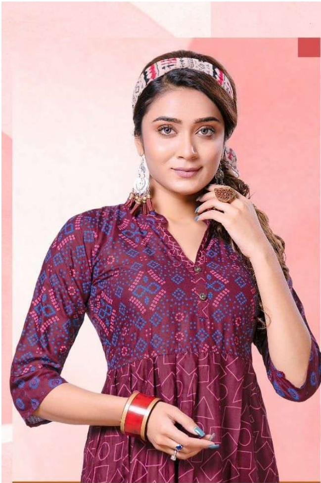
our elegant style and fashion patterns define true quintessence in women