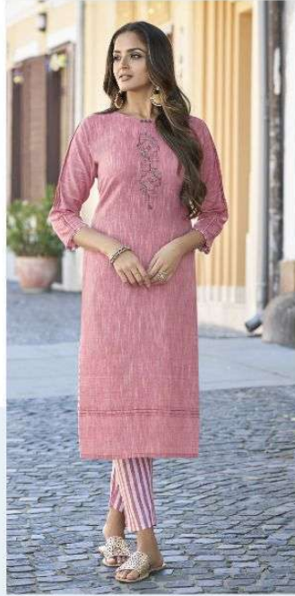
- 613 -