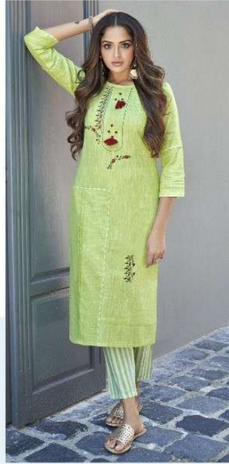
- 614 -