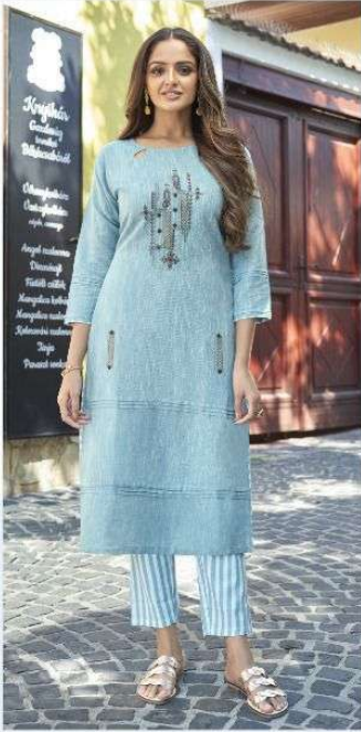
- 612 -