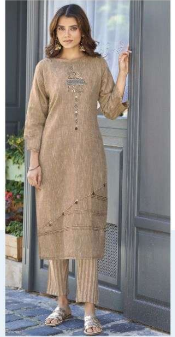
- 615 -