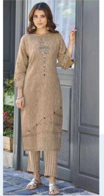
- 615 -