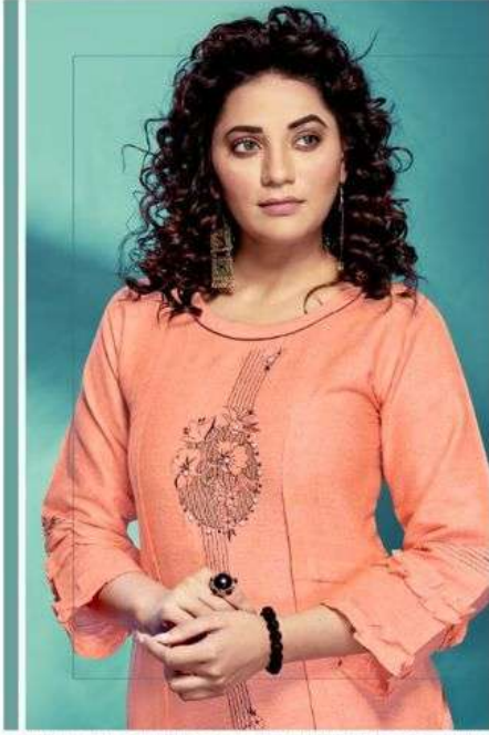
EXTREMELY BEAUTIFUL FASHION PIECE OF ETHNIC WEAR DESIGNED KEEPING GRANDUOUS IN MIND