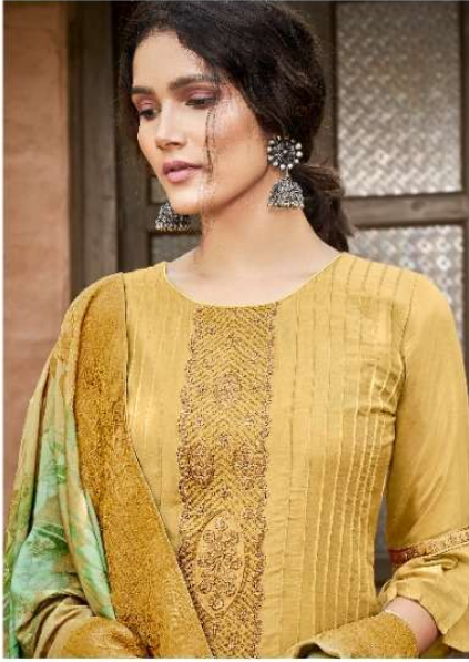
Decided to expand its collection and presents to you a variety of exquisite range to choose from, starting from dresses to embeled sarees fabrics, there is all for you to select from fashion.