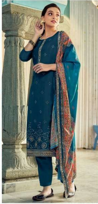
CODE | 3162