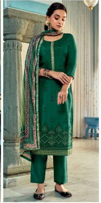
CODE | 3164