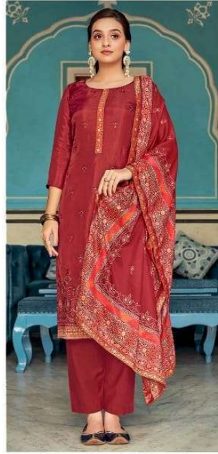
CODE | 3163