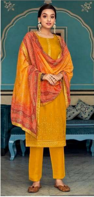
CODE | 3161