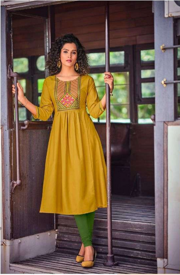
Culture club (Welcome to the new age of style in Indian Saree Where an unmatched prints designs and beautiful. Festivals of fabric)