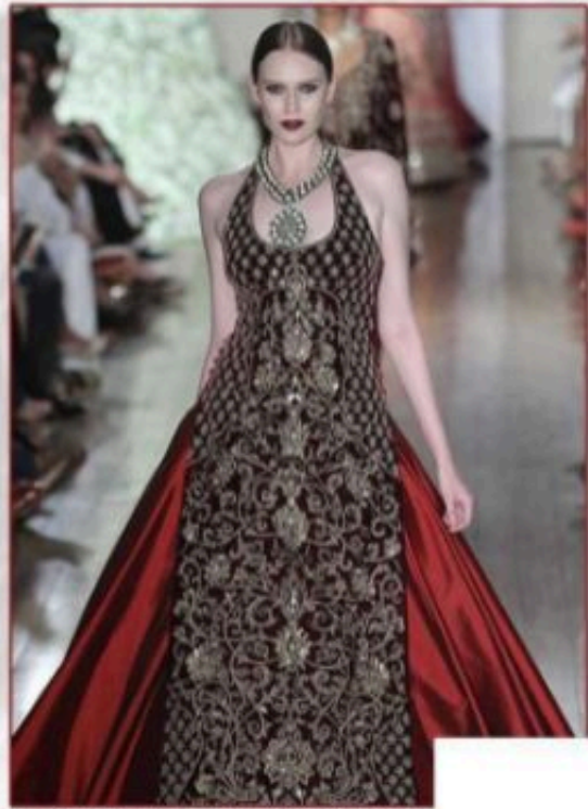
TOP - FOX GEORGETTE WITH HEAVY EMBROIDERY & DARKING WORK BOTTOM - PNER - HEAVY SHANTLN DUPATTA - NET WITH EMBROIDERY