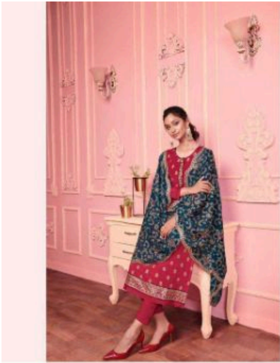
2017 the essence of fashion