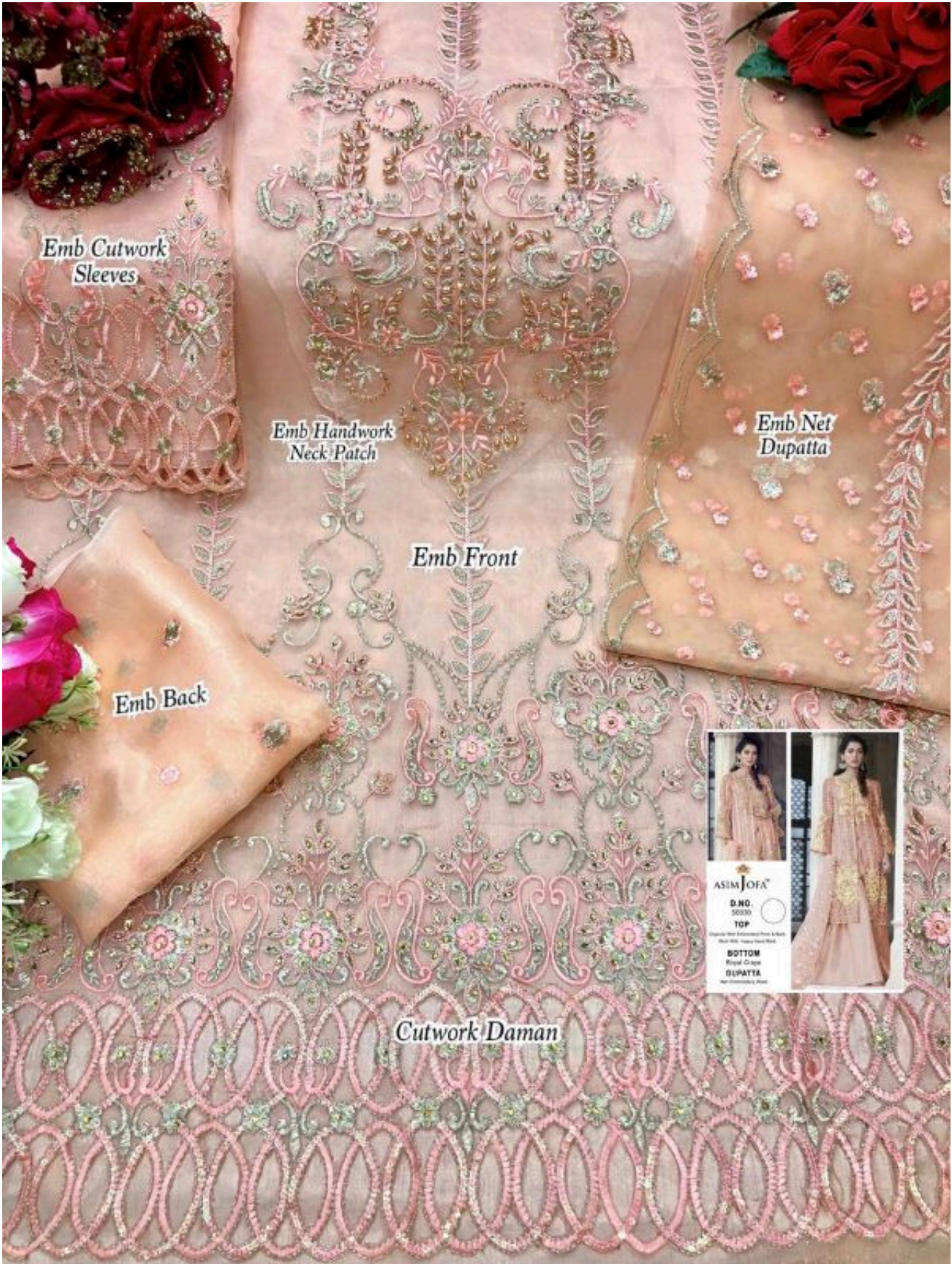
Emb Cutwork Sleeves