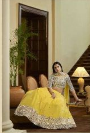
"The glow of sequins in the light of the evening, simplicity" (Code: 1202)