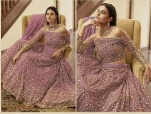
"Dignosa e sofisticada com a charmosa saphira" Código : 7501