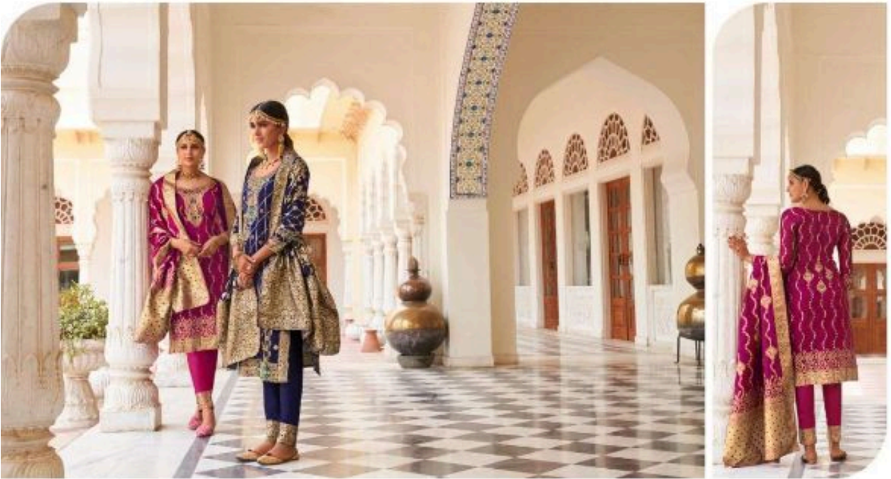
The Gorgeous pink and gold combination with floral motifs for today's style.